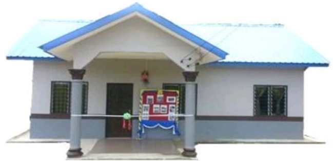
BOMBA : Program Bantuan Rumah (PBR)